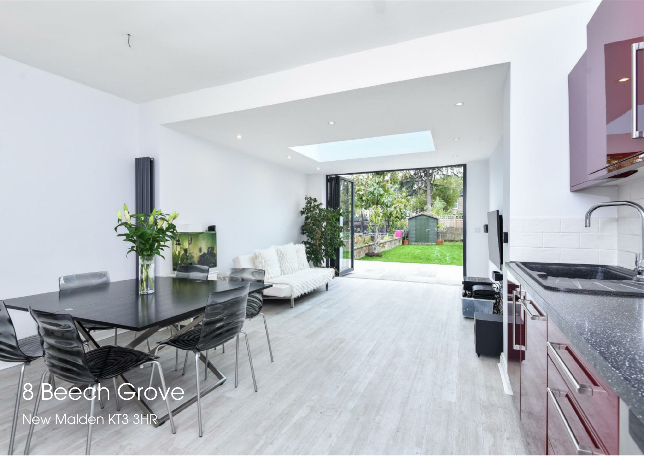
8 Beech Grove New Malden KT3 3HR

gibson lane 34 Richmond Road Kingston upon Thames Surrey KT2 5ED www.gibsonlane.co.uk Tel: 020 8546 5444